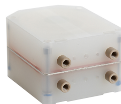
The degasser includes degassing chamber P/N 9000-1523